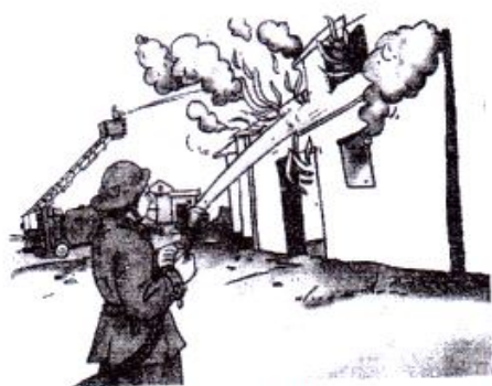
Firemen extinguish the fire by throwing water under pressure